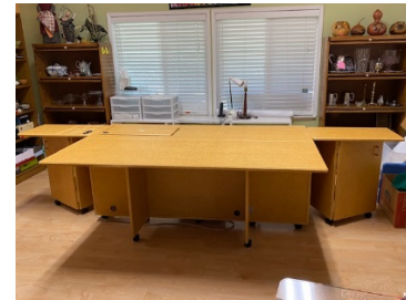
Expanded 123"x 45"

Contact Katie MacDonald 916-616-3224 (cell)