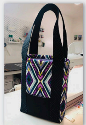
Strap Happy Tote